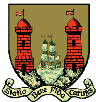
Cork City Council