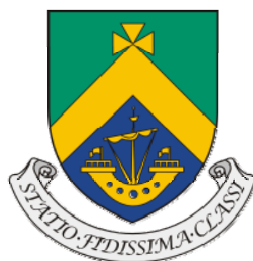
Cobh Town Council