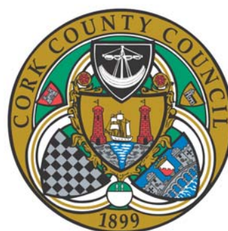
Cork County Council